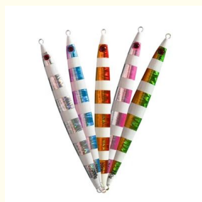
3D simulation fisheye